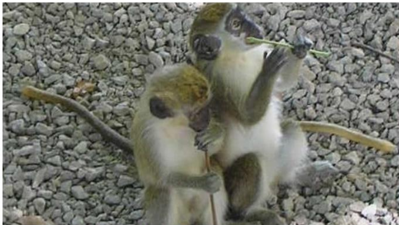
If you arrive on St. Kitts via a cruise ship, you'll see the cuter-than-cute vervet monkeys on the shoulders of entrepreneurial locals who hang out on the Port Zante pier, hoping you'll stop for a photo.

If you arrive on St. Kitts via a cruise ship, you'll see the cuter-than-cute vervet monkeys on the shoulders of entrepreneurial locals who hang out on the Port Zante pier, hoping you'll stop for a photo. If you're on the beach, you'll find the little monkeys foraging for a food handout. As the sun sets, friendly gangs of them raid beach bars like Shiggedy Shack in search of a cocktail sip or two. Mostly vegetarian, the cheeky boozers with expressive black faces arrived with the slaves from West Africa. They developed a taste for alcohol from eating the fermented fruit that blankets the rainforest floors.