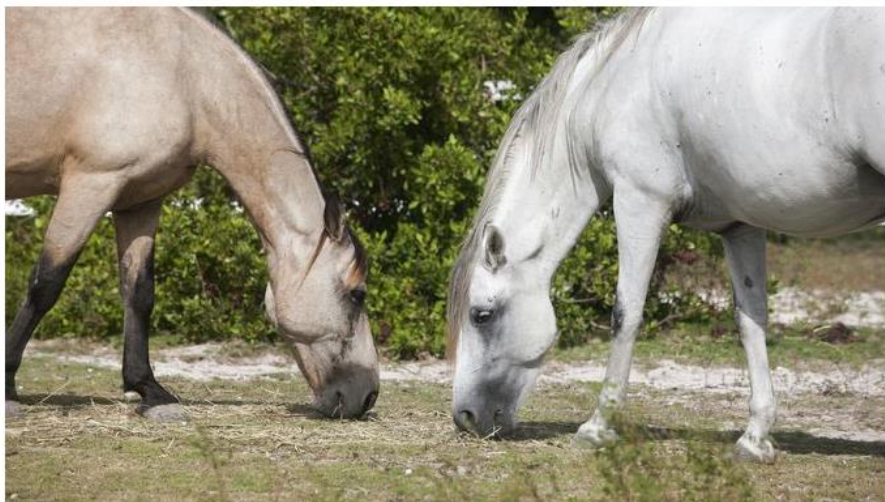
The horses that call Biras Creek home were rescued from Puerto Rico in 2009 and today are part of an interactive program at the Virgin Gorda Resort.

The horses that call Biras Creek home were rescued from Puerto Rico in 2009 and today are part of an interactive program at the Virgin Gorda Resort. An innovative experience offered to guests, visiting and grooming the horses is gratis with classes that teach the fine art of horning around available for a nominal fee. True to their name, Paso Finos are the horses with the 'fine step' and are mellow with experienced equestrians and newbies.