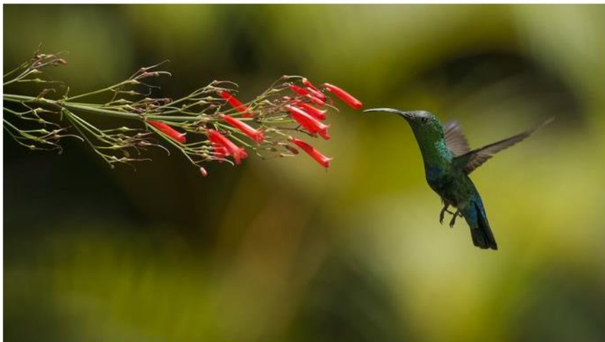
Enthusiasts with eagle eyes (or binoculars) can marvel at more than thirty alluring varieties of birds.

It's literally for the birds at Anse Chastanet , one of the ritziest resorts on the island that also happens to be one of the best bird watching locales. Tours from the resort take nature lovers to some of the most spectacular birding perches in the Caribbean like the Millet Bird Sanctuary Trail where enthusiasts with eagle eyes (or binoculars) marvel at more than thirty alluring varieties like the Red Neck Pigeon with its distinctive maroon-hued plumage and the St. Lucia Pewee with its cinnamon-colored underbelly.