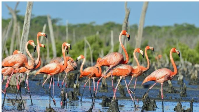
Tourists are treated to vistas of the stately pelicans and flaming orange flamingos as they strut about Cienaga de Zapata National Park.

With easy travel to Cuba looming on the horizon and a US Embassy set to reopen in Havana, the island may soon be as popular with Americans as it is with Europeans and Canadians. Chockablock with history, music, cigars, old cars and spicy fare, Cuba is also home to a thriving ecosystem. On an itinerary organized by Natural Habitat Adventures , tourists are treated to vistas of the stately pelicans and flaming orange flamingos as they strut about Cienaga de Zapata National Park, a 1.5 million acre UNESCO Biosphere Reserve on the southern coast. For those wondering about travel logistics, Natural Habitat books the flight from Miami to Cienfuegos and the return flight from Havana to Miami with a charter company that is authorized to provide direct flights to Cuba.