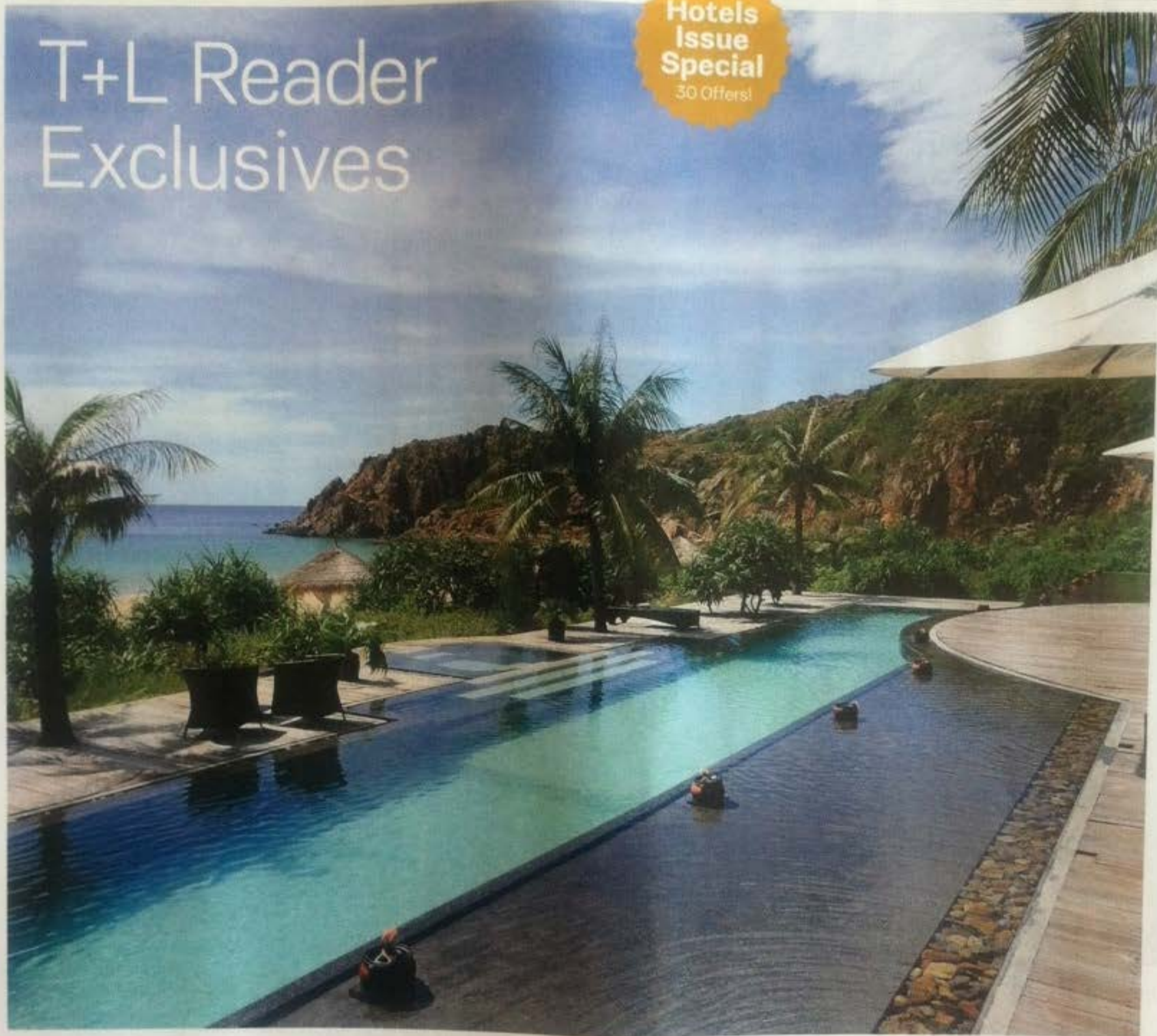
Overlooking the South China Sea from Bai Tram Hideaway, in Vietnam.